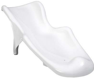
0-9 months Reclined seat with pommel