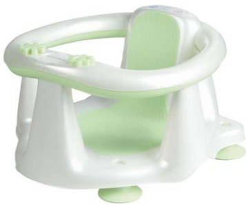
You need to be able to lift your child out of this type.