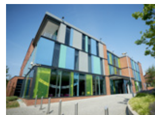
The Reginald Centre

The three dental clinic sites would be: The Reginald Centre in Chapeltown, Yeadon Clinic in Yeadon and Middleton Health Centre.