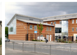
Middleton Health Centre